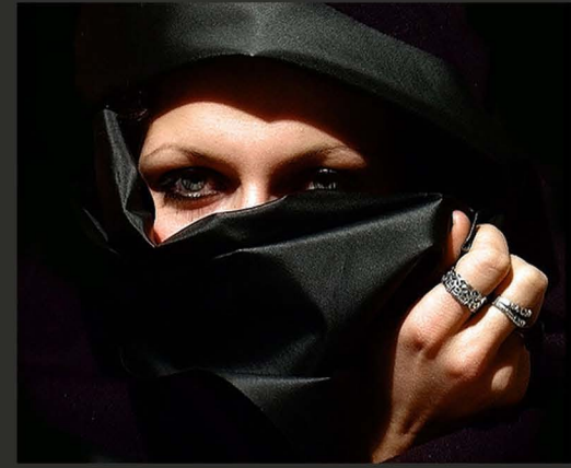
OPEN OR VEILED AS NEED BE.

Attached and held by perimetral pillars. On the other hands independently structured fabric frames are rolled up manually. Said frames are "hang" 20 cms. Off the main structure, leaving open channels for cross ventilation.