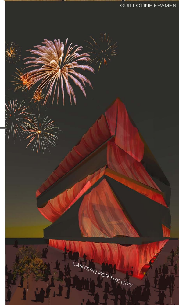
LANTERN FOR THE CITY